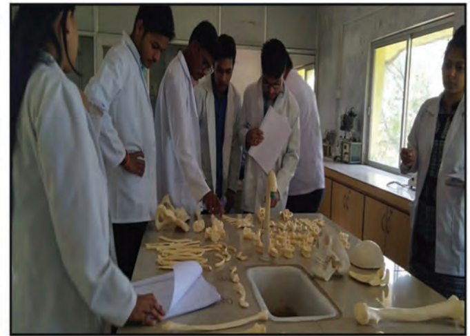
Real Life Experimental Lab