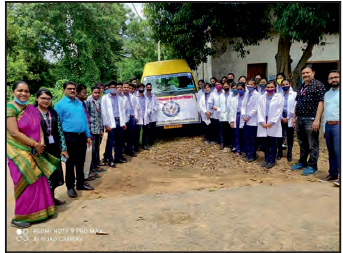
Public Awareness Camp